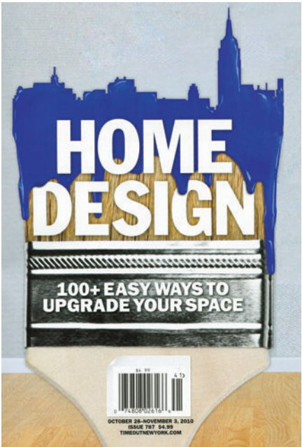
Time Out New York Cover